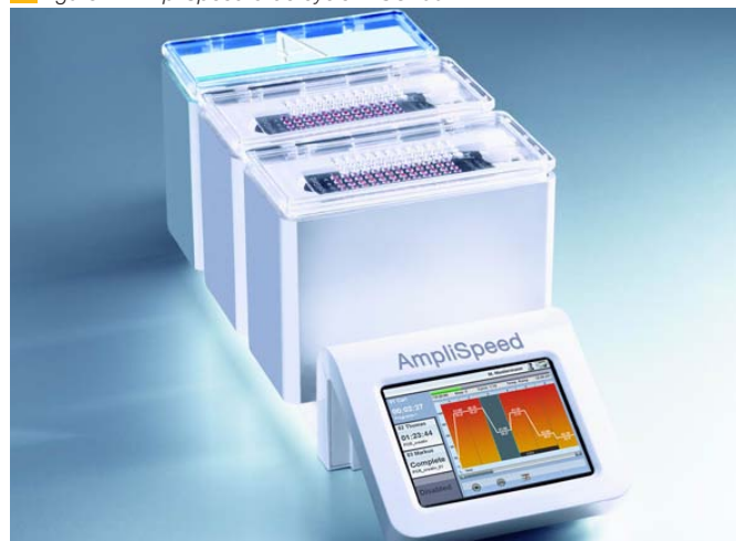
2 Figure 2: AmpliSpeed slide cycler ASC200D

RNasin® is a registered trademark of Promega Corporation, USA